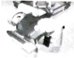
Fig .4. Sigma.x haptic device[16]

superior mechanical stiffness, great precision and the highly efficient performance of the delta.x series make it remarkable. Some of the Force dimension haptic devices have been shown in Fig. 4., Fig. 5. , Fig. 6. & Fig. 7 [13].