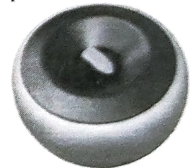
Fig. 9. Magnetic levitation haptic device[21]

Magnetic levitation haptic devices have 3 degree of freedom haptics interface [10]. Maglev haptics is a new technology for the high-fidelity interaction for the virtual objects. This device has been illustrated in Fig. 9. Maglev systems involve the principles of Lorentz levitation. To interact with the virtual environments, the user has to grab a levitated tool handle. These devices have high potential for precise positioning. The device contains large coils that are wound around the handle. Current in the coils interact with magnetic fields and generate forces and torques to provide haptic feedback.