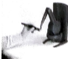
Fig. 2. Geomagic Haptic device[14]

Geomagic, a professional engineering software brand provides Geomagic haptic devices that incorporate a sense of touch into commercial applications and 3 D modeling systems. These devices as shown in Fig. 2, can accurately measure the position and the different alignments of the input devices used [6]. These devices interact with the virtual objects and simulate the touch with the help of the motors being used in the devices. The series of Geomagic haptic devices that are available are Geomagic Touch, Geomagic Touch X, Geomagic Phantom Premium. There are wide variety of Geomagic haptic devices to fit any set of requirements such as range of motion, position and forces. The range of motions supported by Geomagic