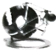
Fig. 5. Omega.3 haptic device[17]