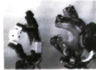
Fig .8. Haptic Gloves[20]

the fingertip inflate and deflate independently depending upon the type of the interacted object.