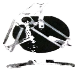
Fig. 6. Delta.3 haptic device[18]